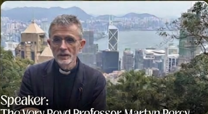
Speaker: The Very Revd Professor Martyn Percy

How should we approach the Bible, and what kind of text is it? 'Bible' comes from the Greek biblos ('books'). It took centuries to evolve, and different churches have different versions: Roman Catholics and the Orthodox include the Apocrypha differently from Protestants, while many Eastern churches put it in a separate section.